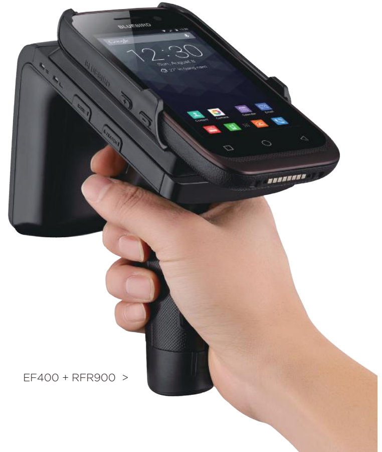
EF400 + RFR900 >

A 13.0 megapixel camera with autofocus optimizes industrial imaging solution and performance speed. We provide just what our customers need.